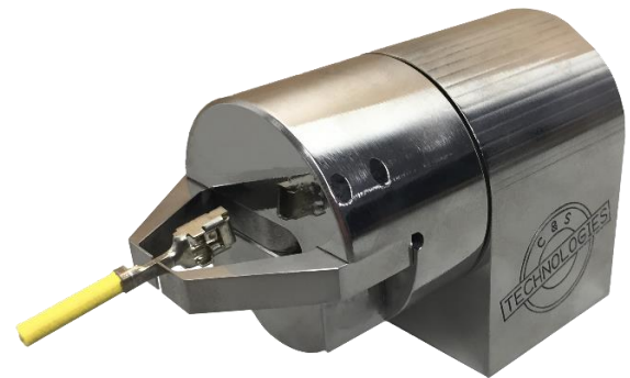
Bend Angle fixture